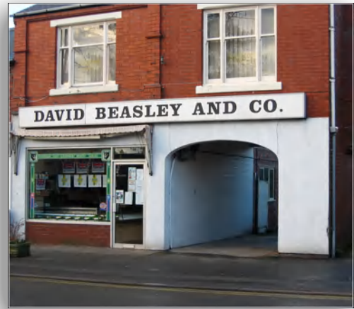
It has been known as David Beasley since 1987.